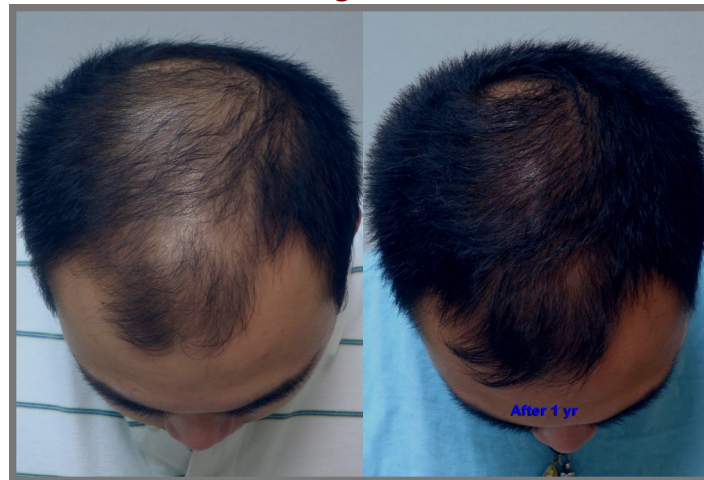
Look at the amazing results one of our patients had after taking Propecia for one year

All medications have benefits as well as side effects so an individualized consultation is certainly needed before starting this medication